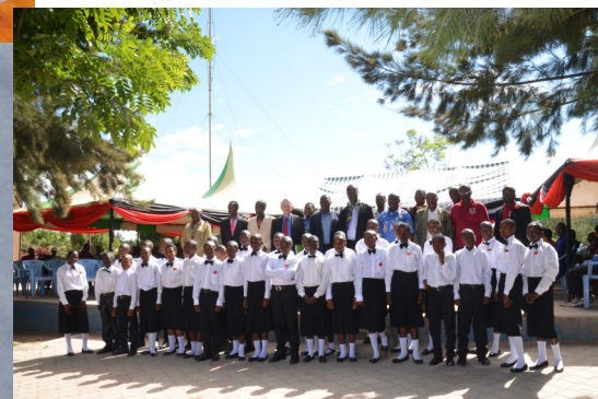
2019 Standard Seven Graduates

Secondary School Fund: Helps supplement sponsorship payments that do not fully cover Secondary School expenses. You are welcome to contribute to this Secondary School Fund at an additional $43 per month. One time investments are also greatly appreciated.