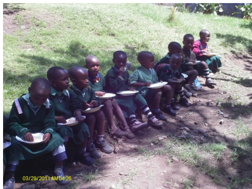
Breakfast & lunch served daily to pre-school and primary students