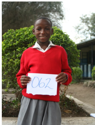
KAC062 Witness Mbis3